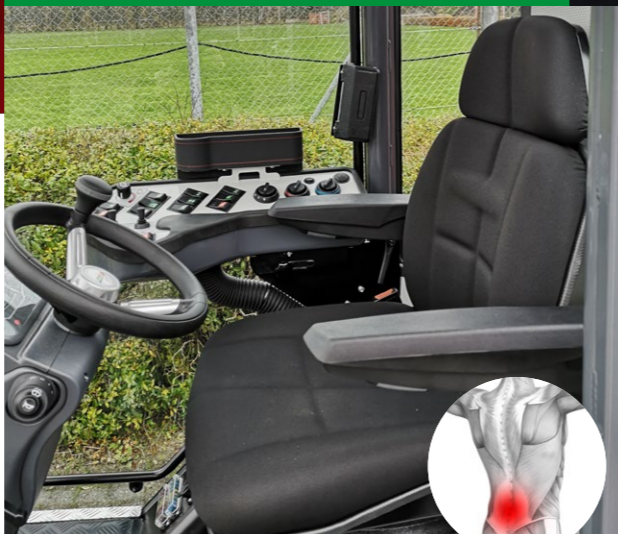
Fully adjustable driver's seat

Forget about hip and back pain. Height adjustment, lumbar support and ergonomic design guarantees maximum comfort.