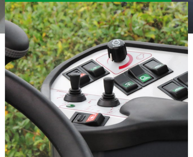
Full control at hand

The Timan 3330 control panel has been developed together with those who operate the machine on a daily basis. Because full control should come naturally. Cruise control, electronic hand throttle and Stop & Go are standard features of the machine.