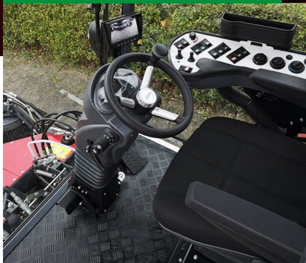
Low noise level and plenty of space

Forget hearing protection and enjoy your music. Gone are the days of stressful and uncomfortable work with just 68 dB at 2,600 rpm in the spacious, air-conditioned cabin. A new type of comfortable foot pedal makes it easy to change travel direction.